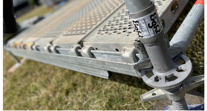
Figure of Eight can provide a whole host of staging services. Whether you know exactly what you need or require a little help in design, specification and execution, we can support you in anyway.