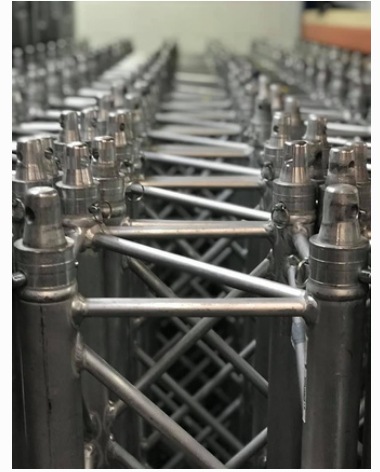
Figure of Eight can get your production in the air! We have the expertise, equipment and experience to provide safe solutions for a whole range of applications from existing venues and outdoor temporary stage roofs to bespoke solutions for specialist 'one off' exhibitions in conjunction with our structural engineers who can provide weight calculations and certification.

Our riggers are fully trained and are both confident and qualified to work at height. All our rigging equipment is covered by our routine maintenance program and conforms with LOLER (Lifting Operations and Lifting Equipment Regulations) 1998.