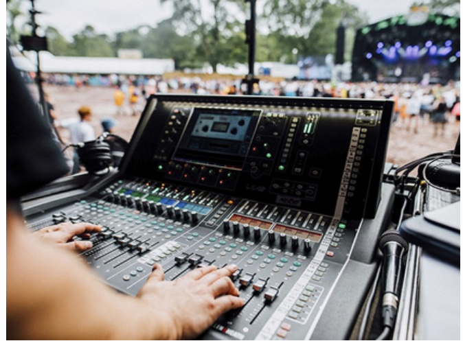
Figure of Eight have the expertise and knowledge to provide a whole host of sound reinforcement for many different applications ranging from concert touring systems to quality outdoor public address equipment. We are able to provide experienced project managers to establish and fulfill your requirements as well as experienced engineers to operate systems. Our ability to pull together the most suitable solution for your event makes us a positive choice when looking for a reliable technical partner.