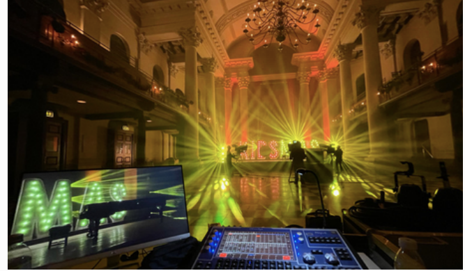
Figure of Eight are specialists in making the most of technology whilst retaining the needs of any given production and working to a budget. From a simple up lighting solution for a semi permanent installation to a one stop stage lighting solution, we can deliver lighting projects on any level.

We offer a whole host of services including: