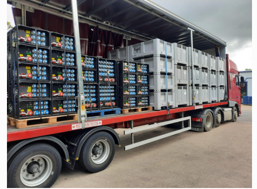
Figure of Eight understand temporary power for events, its what we have done for over a decade! From providing economical generators for food and drink festivals through to providing design and installation for major sporting events and concerts, we have both the expertise and equipment to deliver on time and on budget.

We offer a whole host of services including: